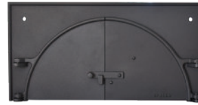
Cast iron façade with double swing door